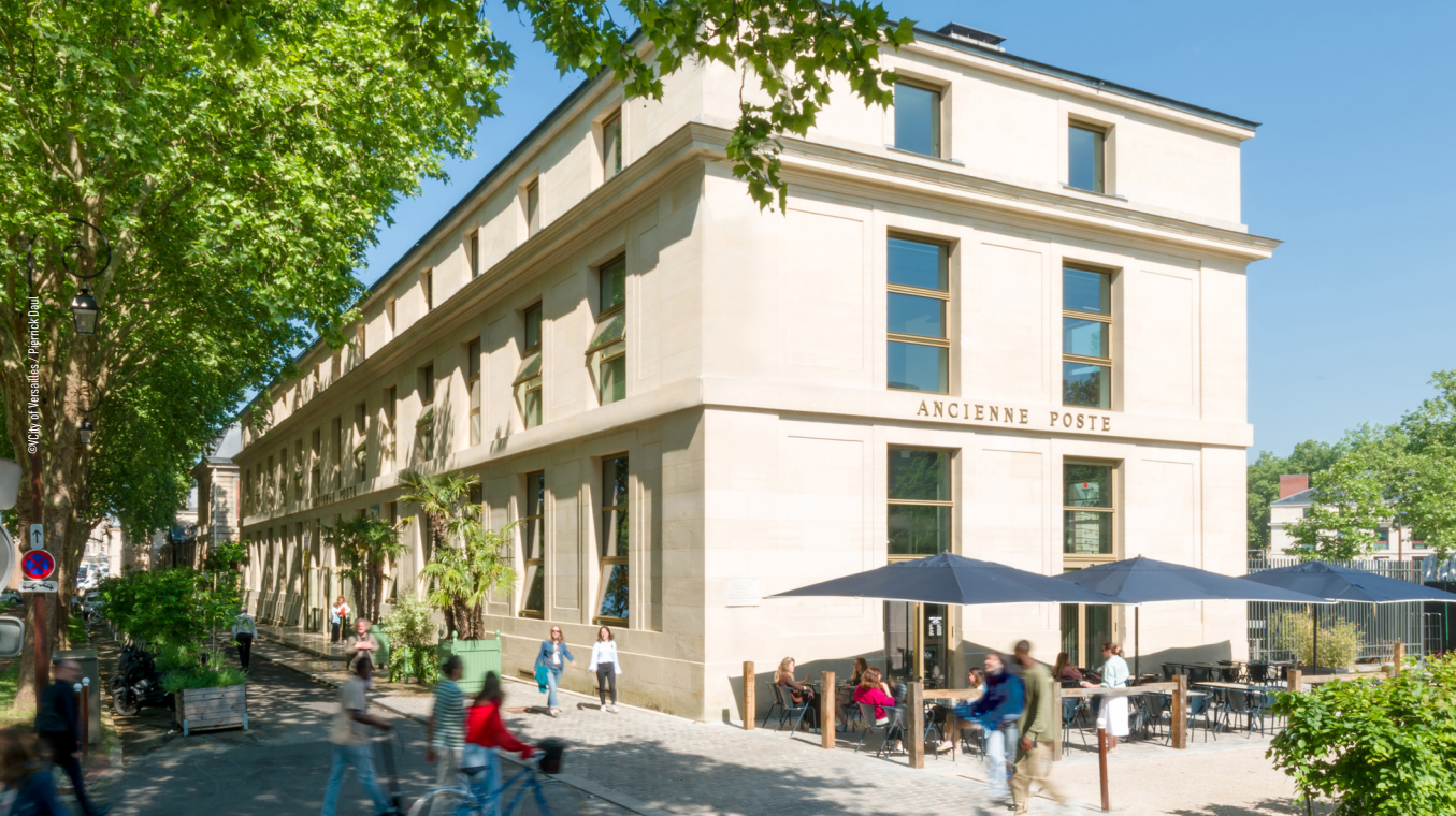
The Ancienne Poste seen from Avenue de Paris