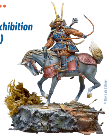
14 th century Samurai warrior

Following the success of the Game Story exhibition held at the Ancienne Poste (Old Post Office) and tracing the history of video games, the City of Versailles presents The World of Figurines, a unique exhibition featuring 25,000 figurines, and celebrating the imaginary world, history and creativity of this ancient form of art, from 17 December 2025 to 15 March 2026.