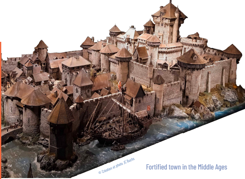
Fortified town in the Middle Ages

The French market in this segment is one of the most dynamic in Europe.